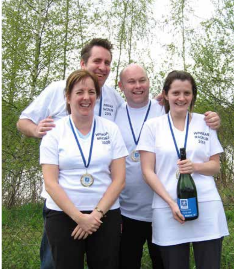
B/C Group Top Dogs, Baldilocks and the Three Hairs