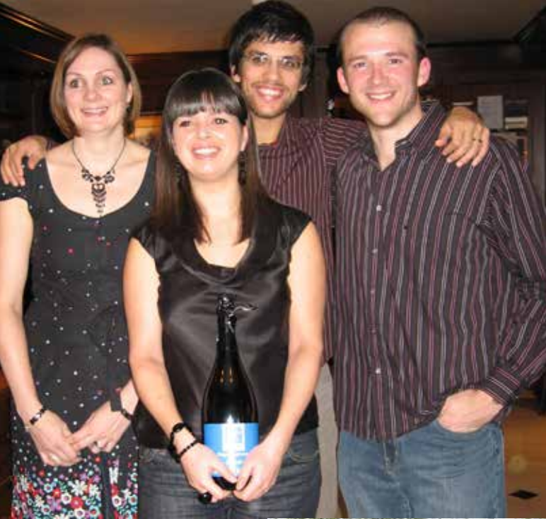
2008, a great year for Southend teams at the Magnum in Belgium! A Group Champions, Essex-Landers